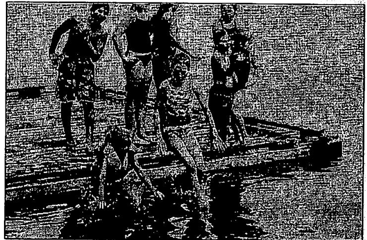
Jumping off the float by the bridge provides another refreshing place to swim.